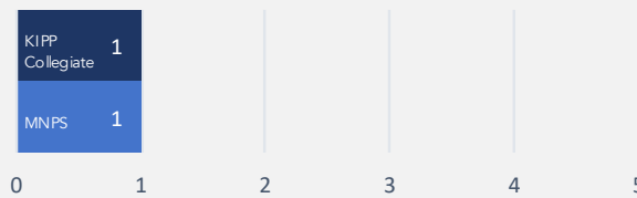
TVAAS GROWTH RATING

Student annual academic growth on a scale of 1-5, with 5 representing the highest growth category